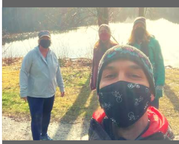
Our Board of Directors decided to meet both in person and virtually during this year's retreat. Some of our favorite conversations came from our small-group walk and talks when we reconnected, shared nature moments, and dreamed for our future!

staff healthy and supported during the pandemic.